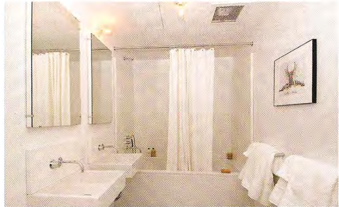
Clean fluffy towels, organic products, a scented candle, and original artwork make this bathroom ready to sell.

Try wallpaper: If you're curious about wallpaper, but intimidated by the commitment, this is a great place to try it out. I love metallic papers in bathrooms; they add an element of offbeat glamour.